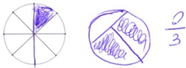
Figure 1. Stella's response to Q.1.6, Q.1.8: Representations for the Fractions 1/4 and 2/3 , respectively.

As shown in Table 1, the students of this profile performed very well in the tasks of Category A (Table 1). On the contrary, their performance was very low in the tasks of Category B (Table 2). In particular, Student 3 (hereafter, Stella) failed in all the tasks of this category. She stated that “the nominator shows how many pieces to take” to justify her answer in Q.1.6, and she drew a circle and partitioned it in three unequal parts in Q.1.8 (Figure 1). None of these students exhibited any understanding of the fundamental principle that the fractional parts of the unit should be equal, as also evidenced by their performance in Q.1.7 (Table 2).