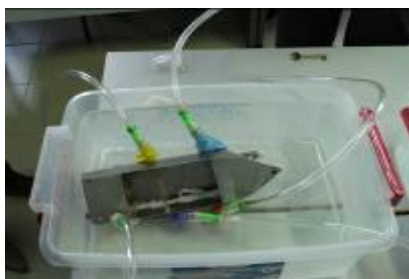
Figure 2: A sunken toy-ship in a water-filled tank.

(ii) The transformation of technological knowledge (B) means the transformation from formal technological knowledge to knowledge understandable to students. The salvage of a sunken toy-ship is a representative example of this didactical transformation. Thus, students are asked to “find” the hidden property density behind a sunken ship (see figure 2).