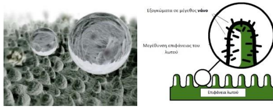
Fig. 1. Different representations of nanobumps a .

For example, they identified the existing relation among the concept of superhydrophobicity, the nanoscale structures (nanobumps) and the self-cleaning phenomenon. Additionally, they conducted experiments observing on which materials the water forms spherical droplets and roll (cabbage leaf, nanotextile, etc.), as well as they watched videos and studied different representations of nanobumps (Fig. 1).